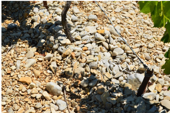
Soil at Prat Sura