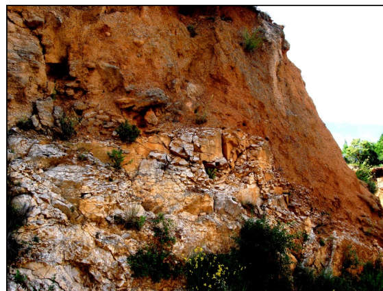
A cutout by the roadside, showing the transition from limestone to iron rich red clay.

Minervois, owes its name to Minerva, the Roman goddess of wisdom, has been known for producing fine wine since the time when the Romans first settled here. AOC Saint-Jean de Minervois is located at the far northeastern corner of Minervois. It is one of the few appellations where one can see exactly where the appellation begins and ends with the naked eye. The appellation consists of a very defined strip of bright white limestone where the Muscat Blanc à Petits Grains is the only grape variety permitted. Within the space of a few feet one can see the soil change dramatically from white to red, which denotes the