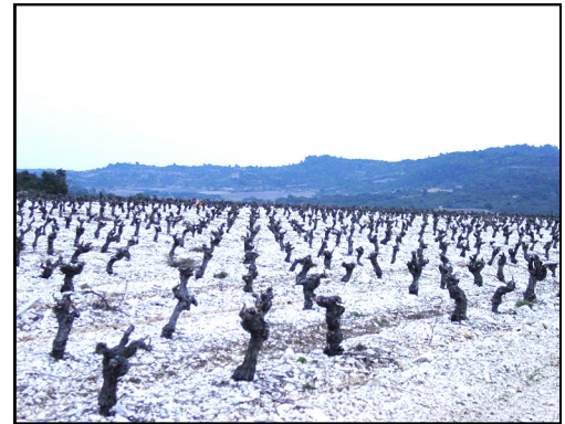
The chalky, white vineyards of Barroubio in AOC St-Jean-de-Minervois.

the appellation begins and ends with the naked eye. The appellation consists of a very defined strip of bright white limestone where the Muscat Blanc à Petits Grains is the only grape variety permitted. Within the space of a few feet one can see the soil change dramatically from white to red, which denotes the boundary of the appellation. The sandy, clay-rich red soil is where the red grapes that produce AOC Minervois Rouge grow. In Saint-Jean de Minervois, the extremely chalky soil and high altitudes (Barroubio's vineyards are at 300 meters above sea level) produce an exceedingly complex and structured Muscat. Maximum yields for the Muscat are 28 hectoliters per hectare, although Domaine de Barroubio's miniscule yields are often half of that. There are only six producers that estate-bottle in this tiny appellation. The one cooperative still produces 75% of the wine in Saint-Jean de Minervois.