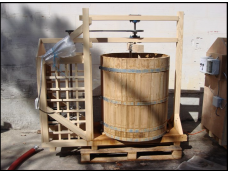
Mixer for preparing biodynamic treatments

domaine is its unique terroir. In Buisson the vineyards lie on hillsides covered with gravelly soil composed of chalky pebbles, with an underlying strata of rocks that push up almost vertically. The vertical substrata causes the soil to change composition into three distinct and radically different zones within the space of 250 meters: marl (limy, bluish clay of Pliocene age deposits); yellow sand with mica; and sandyclay. The complex soil means more work for Vincent because the care needed by the vines varies according to the soil in which they are planted. However, this also lends more