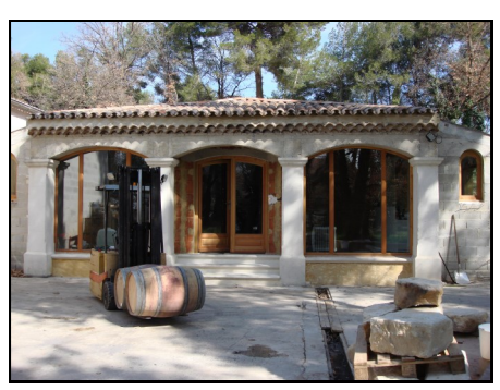
The Cellars at Roche-Audran

One of the most fascinating aspects of this domaine is its unique terroir. In Buisson the vineyards lie on hillsides covered with gravelly soil composed of chalky pebbles, with an underlying strata of rocks that push up almost vertically. The