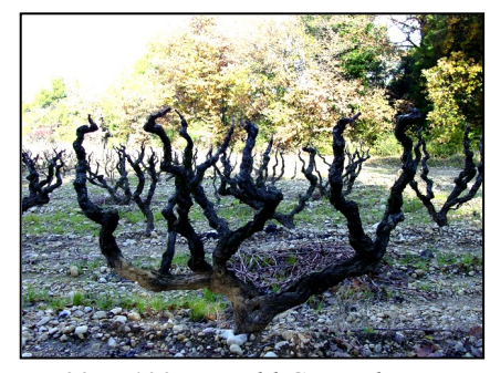
90 to 100 year old Grenache vines at Roche-Audran used for his "Cuvée César"