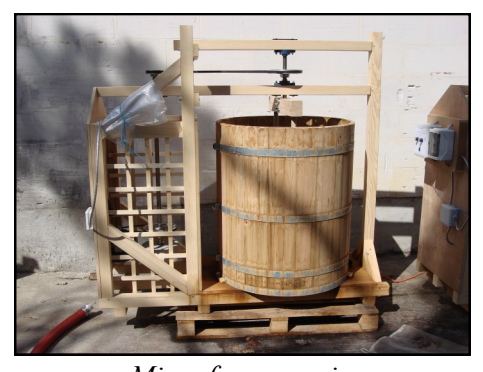
Mixer for preparing biodynamic treatments

One of the most fascinating aspects of this domaine is its unique terroir. In Buisson the vineyards lie on hillsides covered with gravelly soil composed of chalky pebbles, with an underlying strata of rocks that push up almost vertically. The vertical substrata causes the soil to change composition into three distinct