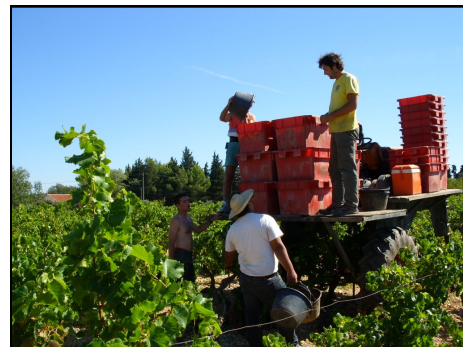
Harvest in Biscarelle's Vineyards