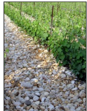
Soil at Montcalmès

Tasting Notes: The nose of this wine is full of red cherry fruit, perfumed with hints of violet flowers. In the mouth the wine is full of blackberry, cassis, and black cherry fruit flavors, accented by subtle hints of garrigue spice. The finish is long and lingering, with soft velvety tannins. Though the wines are age worthy, it is the purity and elegance, that are the hallmarks of Domaine de Montcalmès, that make the wine equally enjoyable in its youth.