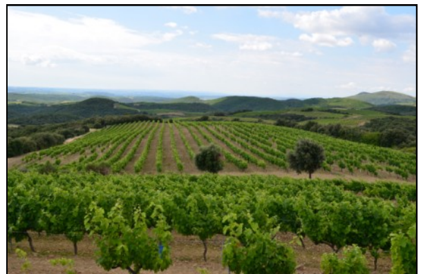
Vineyards at Haut Lignières