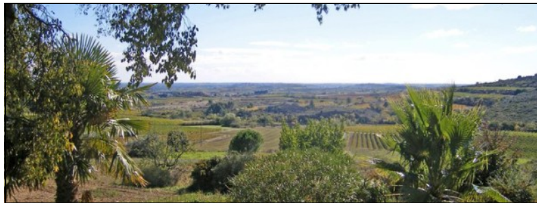
View from the Winery

The name Cadablès is the name of a now extinct volcano that greatly contributes to this region's fascinating geology. Cadablès, literally translated means catapult, which may come from the fact that the volcano catapulted volcanic rock across the area's vineyard land. The result is an interesting mix of igneous and alluvial deposits in the vineyards. An additional oddity is the fact that there was oil discovered in this area. From 1925 to 1950 oil derricks dotted the landscape. To this day, at the nearby medieval monastery, a small shed still stands at the site of a naturally occurring oil well. Apparently the monks used the oil for their salves and healing ointments.