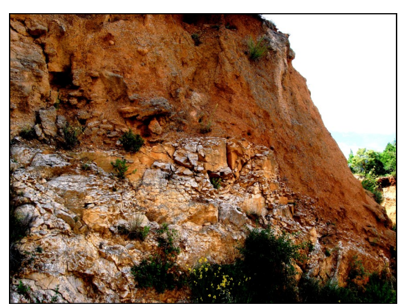
A cutout by the roadside, showing the transition from limestone to iron rich red clay.

There are only six private producers in this tiny appellation. The one cooperative still produces 75% of the wine in Saint-Jean de Minervois.