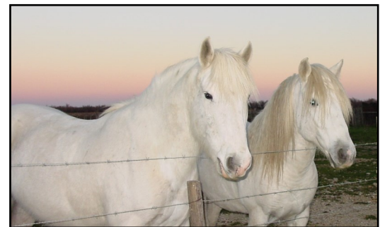
White Camargue Ponies