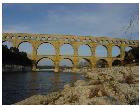
The Pont du Gard