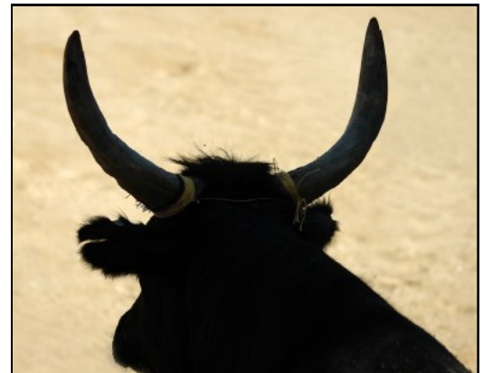
A black Bull, in the Arena of Nîmes