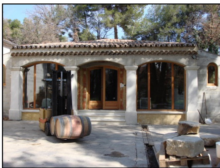
The Cellars at Roche-Audran

One of the most fascinating aspects of this domaine is its unique terroir. In Buisson the vineyards lie on hillsides covered with gravelly soil composed of chalky pebbles, with an underlying strata of rocks that push up almost vertically. The vertical substrata causes the soil to change composition into three distinct and radically different zones within the space of 250 meters: marl (limy, bluish clay of Pliocene age deposits); yellow sand with mica; and sandy-clay. The complex soil means more work for Vincent because the care needed by the vines varies according to the soil in which they are planted. However, this also lends more complexity to the wine