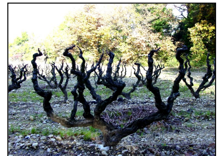
90 to 100 year old Grenache vines at Roche-Audran used for his "Cuvée César"

One of the most fascinating aspects of this domaine is its unique terroir. In Buisson the vineyards lie on hillsides covered with gravelly soil composed of chalky pebbles, with an underlying strata of rocks that push up almost vertically. The vertical substrata causes the soil to change composition into three distinct and radically different zones within the space of 250 meters: marl (limy, bluish clay of Pliocene age deposits); yellow sand with mica; and sandy-clay. The complex soil means more work for Vincent because the care needed by the vines varies according to the soil in which they are planted. However, this also lends more complexity to the wine