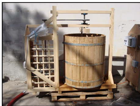
Mixer for preparing biodynamic treatments