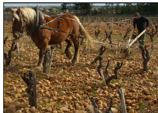
A plow-horse is the only practical way of tilling the old vines in the cobblestone filled "Les Anglaises" vineyard.