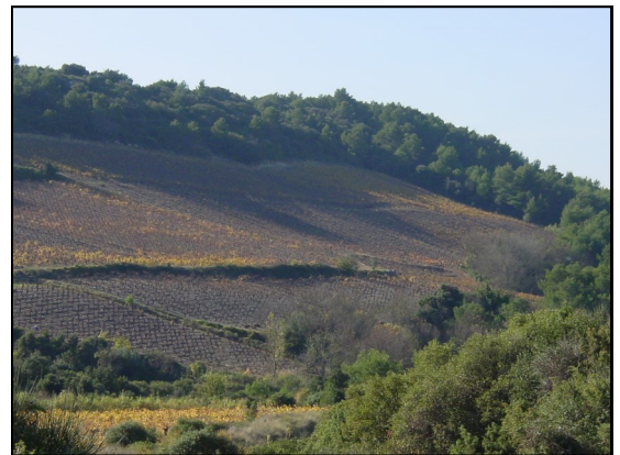
Yves' hillside vineyards - late winter