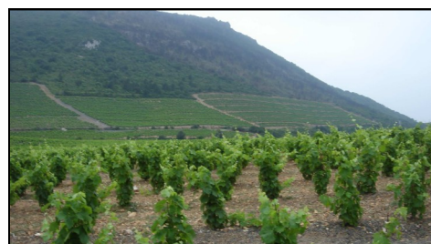
The La Sabina Vineyard