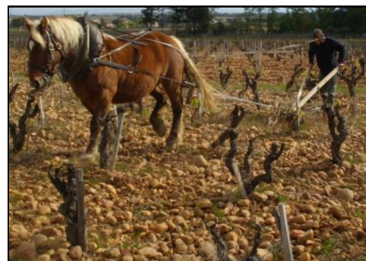
A plow-horse is the only practical way of tilling the old vines in the cobblestone filled "Les Anglaises" vineyard.