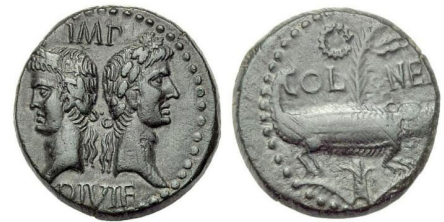
Roman coin showing a crocodile chained to a palm tree