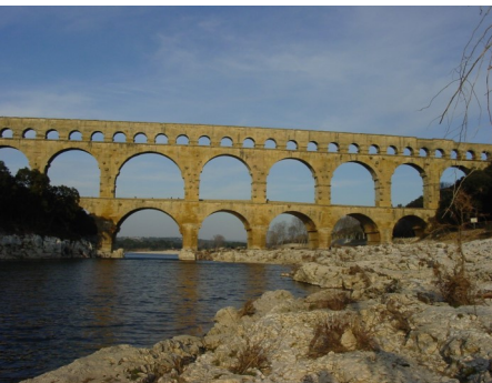
The Pont du Gard