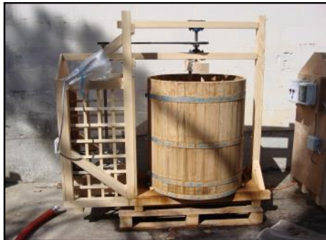
Mixer for preparing biodynamic treatments

One of the most fascinating aspects of this domaine is its unique terroir. In Buisson the vineyards lie on hillsides covered with gravelly soil composed of chalky pebbles, with an underlying strata of rocks that push up almost vertically. The vertical substrata causes the soil to change composition into three distinct and radically different zones within the space of 250 meters: marl (limy, bluish clay of Pliocene age deposits); yellow sand with mica; and sandy-clay. The complex soil means more work for Vincent because the care needed by the vines varies according to the soil in which they are planted. However, this also lends more