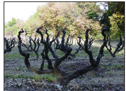
90 to 100 year old Grenache vines at Roche-Audran used for his "Cuvée César"