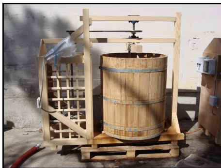
Mixer for preparing biodynamic treatments

One of the most fascinating aspects of this domaine is its unique terroir. In Buisson the vineyards lie on hillsides covered with gravelly soil composed of chalky pebbles, with an underlying strata of rocks that push up almost vertically. The vertical substrata causes the soil to change composition into three distinct and radically different zones within the space of 250 meters: marl (limy, bluish clay of Pliocene age deposits); yellow sand with mica; and sandy-clay. The complex soil means more work for Vincent because the care needed by the vines varies according to the soil in which they are planted. However, this also lends more complexity to the wine and allows him more blending flexibility from vintage to vintage.