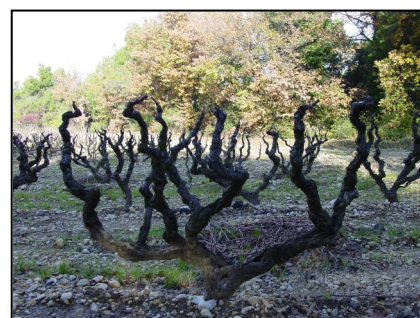
90 to 100 year old Grenache vines at Roche-Audran

One of the most fascinating aspects of this domaine is its unique terroir. In Buisson the vineyards lie on hillsides covered with gravelly soil composed of chalky pebbles, with an underlying strata of rocks that push up almost vertically. The vertical substrata causes the soil to change composition into three distinct and radically different zones within the space of 250 meters: marl (limy, bluish clay of Pliocene age deposits); yellow sand with mica; and sandy-clay. The complex soil means more work for Vincent because the care needed by the vines varies according to the soil in which they are planted. However, this also lends more complexity to the wine and allows him more blending flexibility from