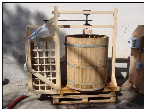
Mixer for preparing biodynamic treatments