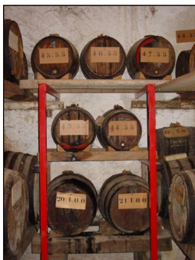
The cellar at Domaine de Rancy