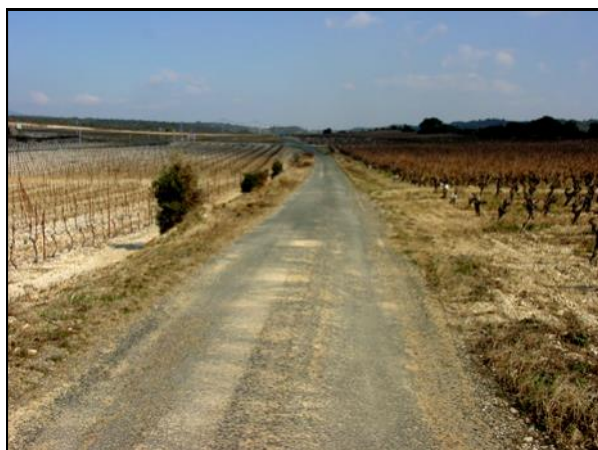
To the left: white limestone soil for Muscat vineyards To the right: iron-rich soil for red grape varieties

where one can see exactly where the appellation begins and ends with the naked eye. The appellation consists of a very defined strip of bright white limestone where the Muscat Blanc à Petits Grains is the only grape variety permitted. Within the space of a few feet one can see the soil change dramatically from white to red, which denotes the boundary of the appellation. The sandy, clay-rich red soil is where the red grapes that produce AOC Minervois Rouge grow. In Saint-Jean de Minervois, the extremely chalky soil and high altitudes (Barroubio's vineyards are at 300 meters above sea level) produce an exceedingly complex and structured Muscat. Maximum yields for the Muscat are 28 hectoliters per hectare, although Domaine de Barroubio's miniscule yields are often half of that. There are only six producers that estate-bottle in this tiny appellation. The one cooperative still produces 75% of the wine in Saint-Jean de Minervois.