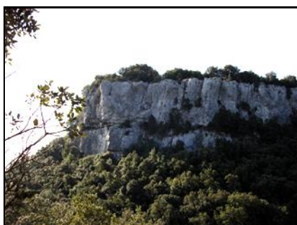
Limestone cliffs at Barroubio