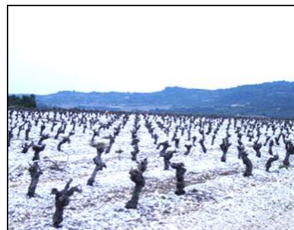
The chalky, white vineyards of Barroubio in AOC St-Jean-de-Minervois.

consists of a very defined strip of bright white limestone where the Muscat Blanc à Petits Grains is the only grape variety permitted. Within the space of a few feet one can see the soil change dramatically from white to red, which denotes the boundary of the appellation. The sandy, clay-rich red soil is where the red grapes that produce AOC Minervois Rouge grow. In Saint-Jean de Minervois, the extremely chalky soil and high altitudes (Barroubio's vineyards are at 300 meters above sea level) produce an exceedingly complex and structured Muscat. Maximum yields for the Muscat are 28 hectoliters per hectare, although Domaine de Barroubio's miniscule yields are often half of that. There are only six producers that estate-bottle in this tiny appellation. The one cooperative still produces 75% of the wine in Saint-Jean de Minervois.